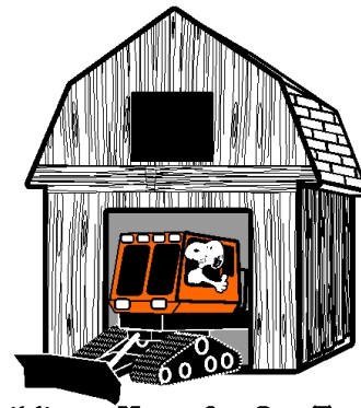
Building a Home for Our Tucker

If you purchased a raffle ticket at the Cook Shack, please hold on to it. Due to low ticket sales, the drawing will be combined with an upcoming 50/50 raffle. We're sorry for any inconvenience.